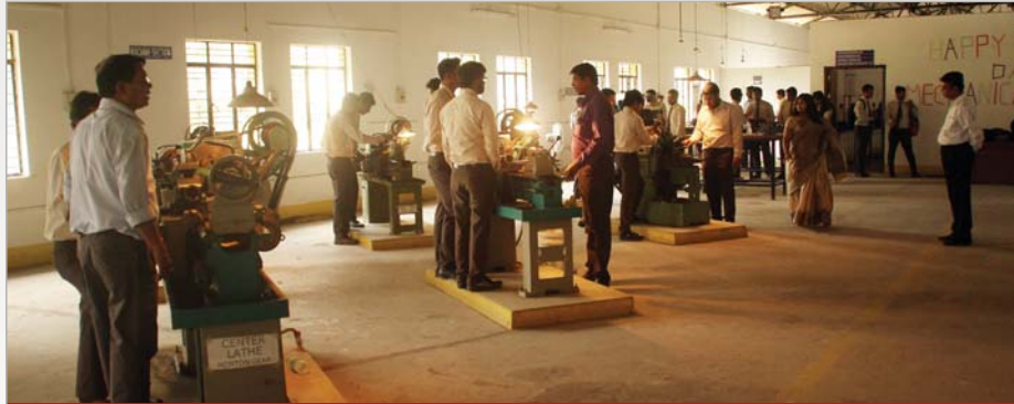
State of the art Workshop