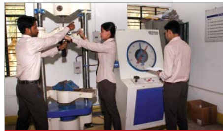
State of the art Laboratories