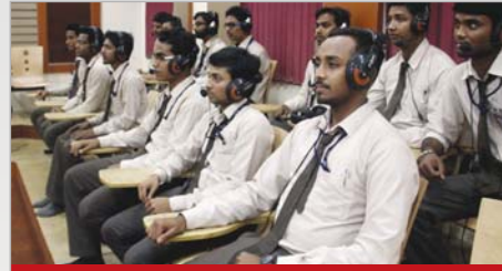
AC Language Lab installed by STEP IIT KGP