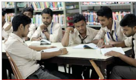
Digitised Library Facility