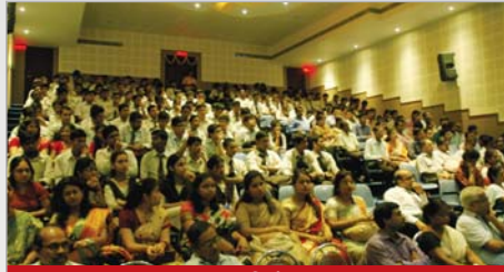
State of the art AC Auditorium