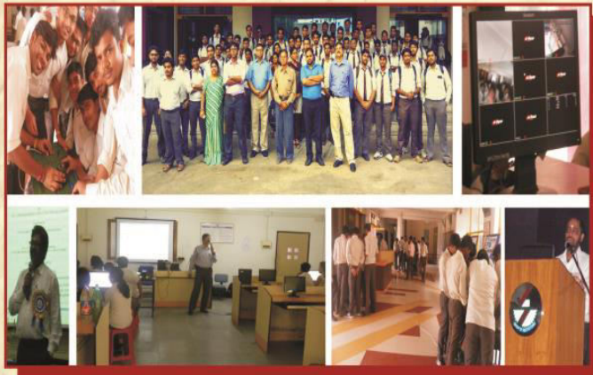
Technical Workshop on PLC and CCTV Installation at Dept. of Electrical Engineering