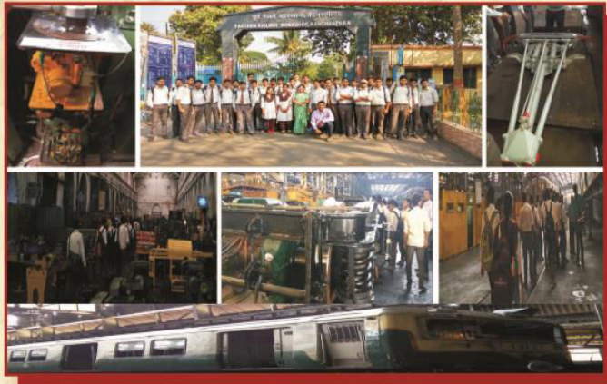
Industrial Visit at Eastern Railway Workshop, Kanchrapara